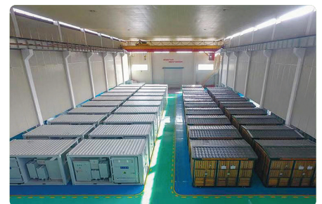
34.5kV MV Prefabricated Power Station