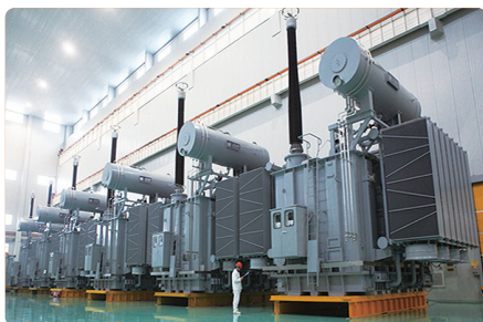
115kV - 765kV Power Transformers & Shunt Reactors